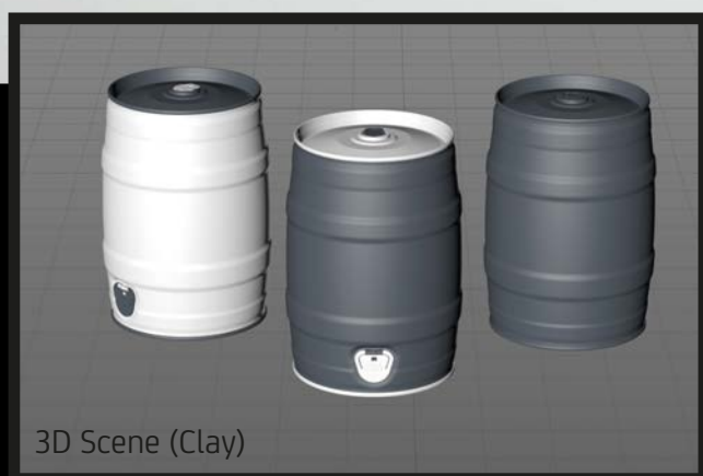
3D Scene (Clay)